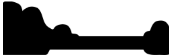
BCA-355 1 1/8" x 3 1/2" FJ Poplar