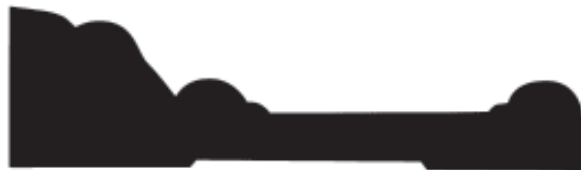
RB 3 1 1/16" x 3 1/2" FJ Primed Pine

Note: Profiles not actual size, see moulding section for architectural profiles.