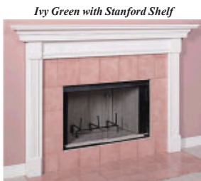
Ivy Green with Stanford Shelf