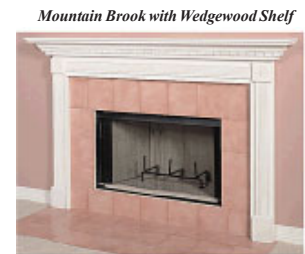
Mountain Brook with Wedgewood Shelf